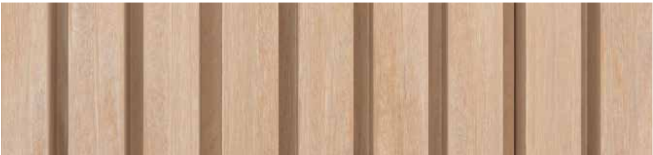
Natural Oak – Bioseal UV Seal Clear