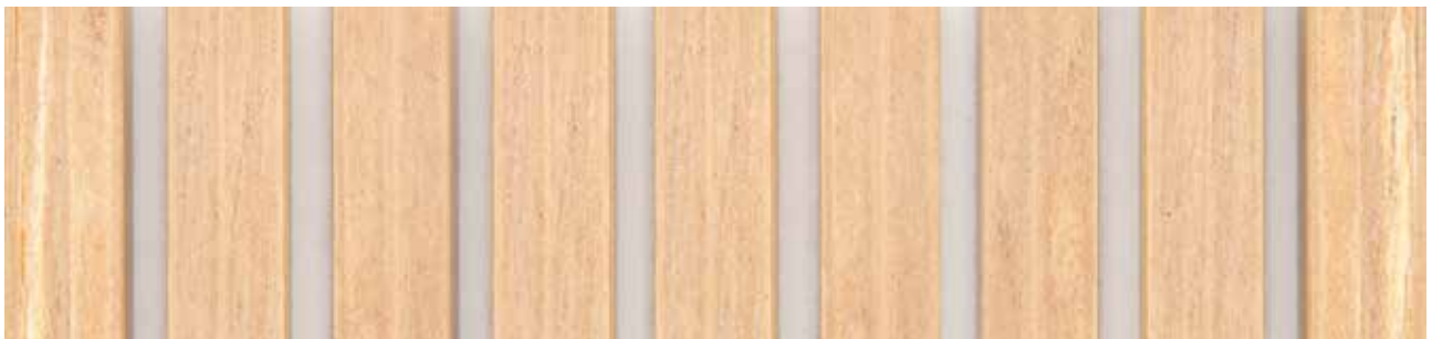
Natural Oak with White Rebate – Bioseal UV Seal Clear – WPO18035