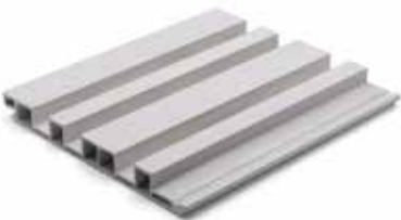
Biowood Castellated Board WPO25028

180 x 25 x 5850 mm 180mm actual cover Weight: 9.00 kg/m 2