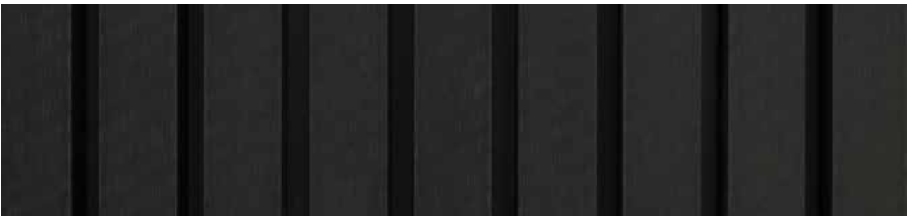
Black Japan – Bioseal UV Seal Black