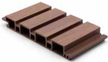
Biowood Castellated Board WPO18025A

180 x 35 x 5850 mm 180mm actual cover Weight: 10.20 kg/m 2