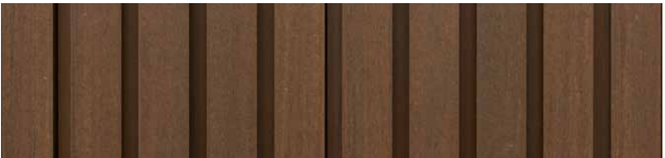
Deep Walnut – Bioseal UV Seal Brown