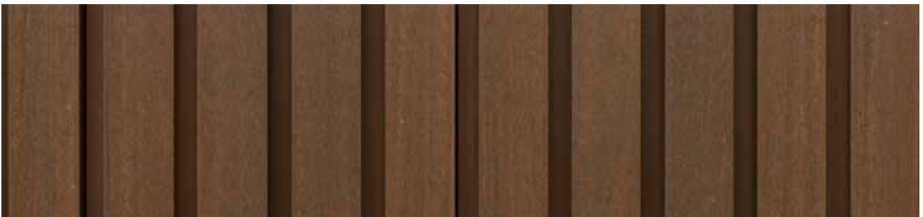
Western Red Cedar – Bioseal UV Seal Clear

Colors and textures shown are purely indicative. Please check our real samples for approval. Biowood is classified as natural product. Considering the presence of natural wood fibers, colors and grain variation is to be expected from batch to batch.