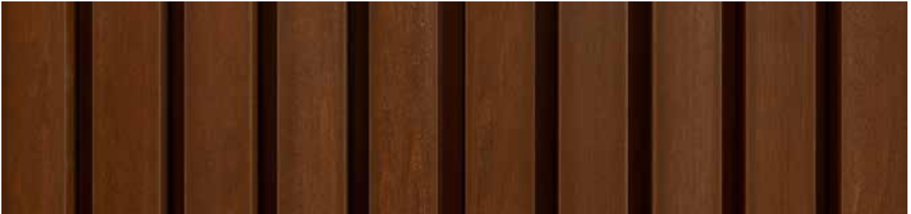
Spotted Gum – Bioseal UV Seal Brown

Brushed UV Sealed (Indoor & Outdoor Application)