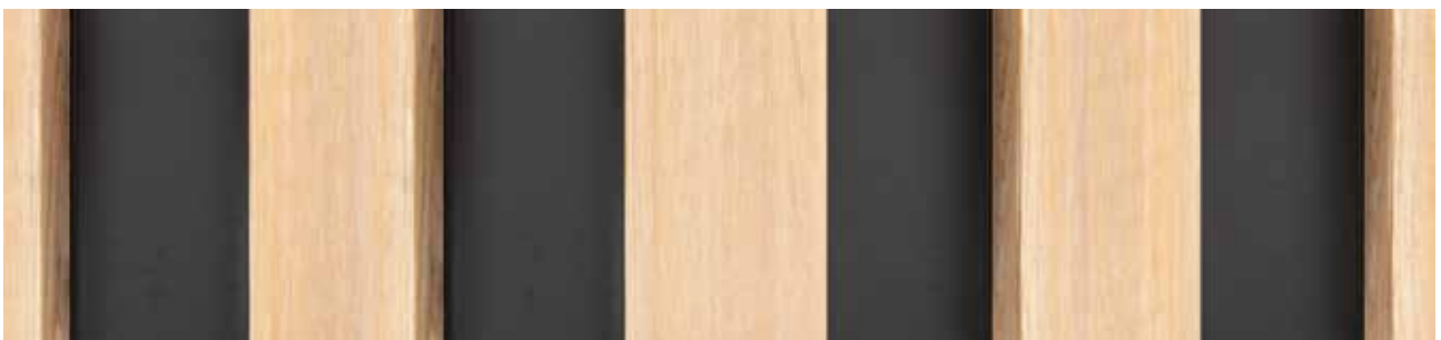
Natural Oak with Black Rebate – Bioseal UV Seal Clear – WPO30060

Colors and textures shown are purely indicative. Please check our real samples for approval. Biowood is classified as natural product. Considering the presence of natural wood fibers, colors and grain variation is to be expected from batch to batch.