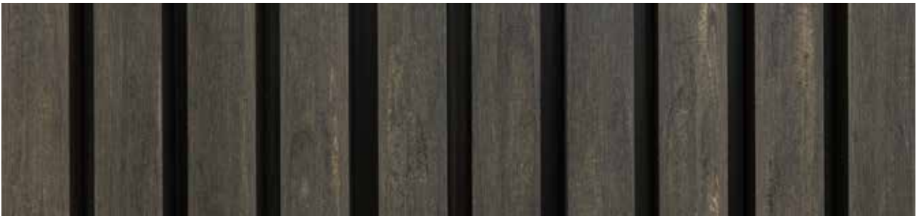
Weatherwood – Bioseal UV Seal Clear