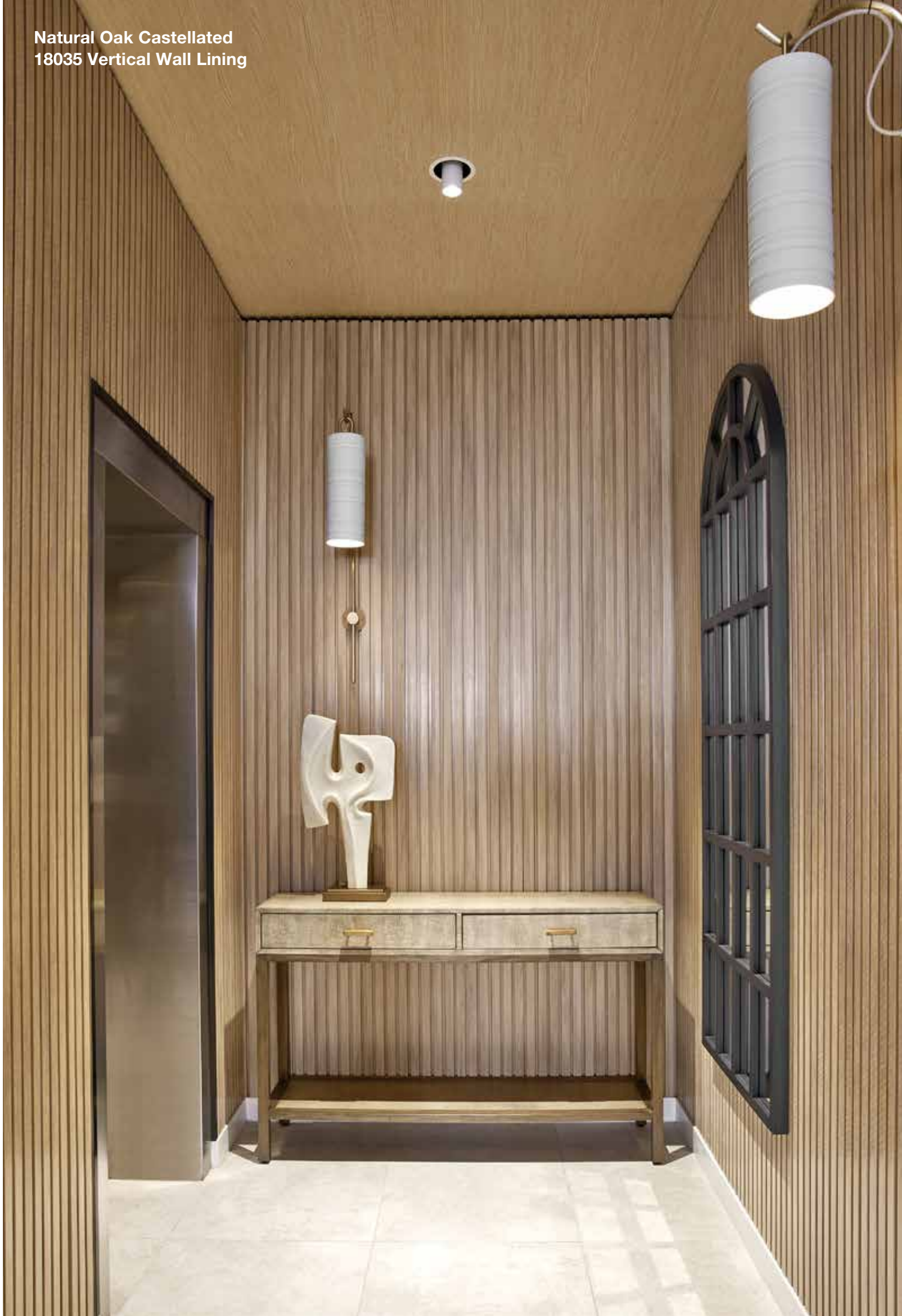
Natural Oak Castellated 18035 Vertical Wall Lining