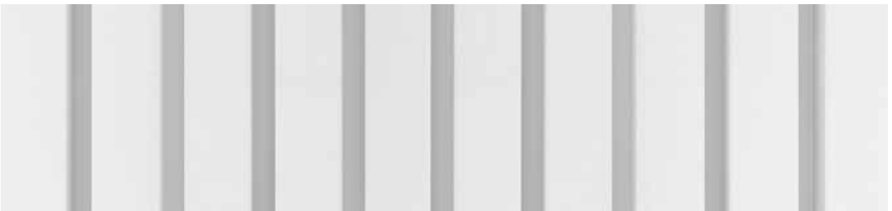
Lexicon White – Bioseal UV Seal

Colors and textures shown are purely indicative. Please check our real samples for approval. Biowood is classified as natural product. Considering the presence of natural wood fibers, colors and grain variation is to be expected from batch to batch.