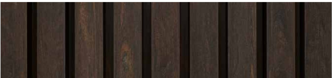
American Walnut – Bioseal UV Seal Clear

Colors and textures shown are purely indicative. Please check our real samples for approval. Biowood is classified as natural product. Considering the presence of natural wood fibers, colors and grain variation is to be expected from batch to batch.