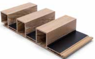
Biowood Castellated Board WPO30060

250 x 28 x 5850 mm 250mm actual cover Weight 6.01 kg/m 2