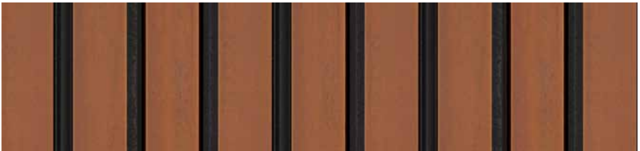
Spotted Gum with Black Rebate – Bioseal UV Brown – WPO18035

Two Tone (Black/White Rebates) Prime Range: Profile WPO18035 & WPO30060