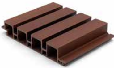
Biowood Castellated Board WPO18035

180 x 35 x 5850 mm 180mm actual cover Weight: 10.20 kg/m 2