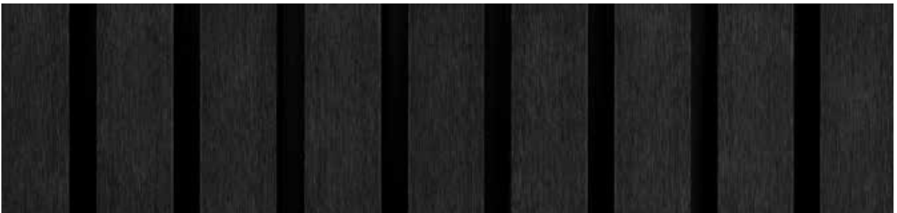
Charred Wood – Bioseal UV Seal Monument

Brushed UV Sealed (Indoor & Outdoor Application)