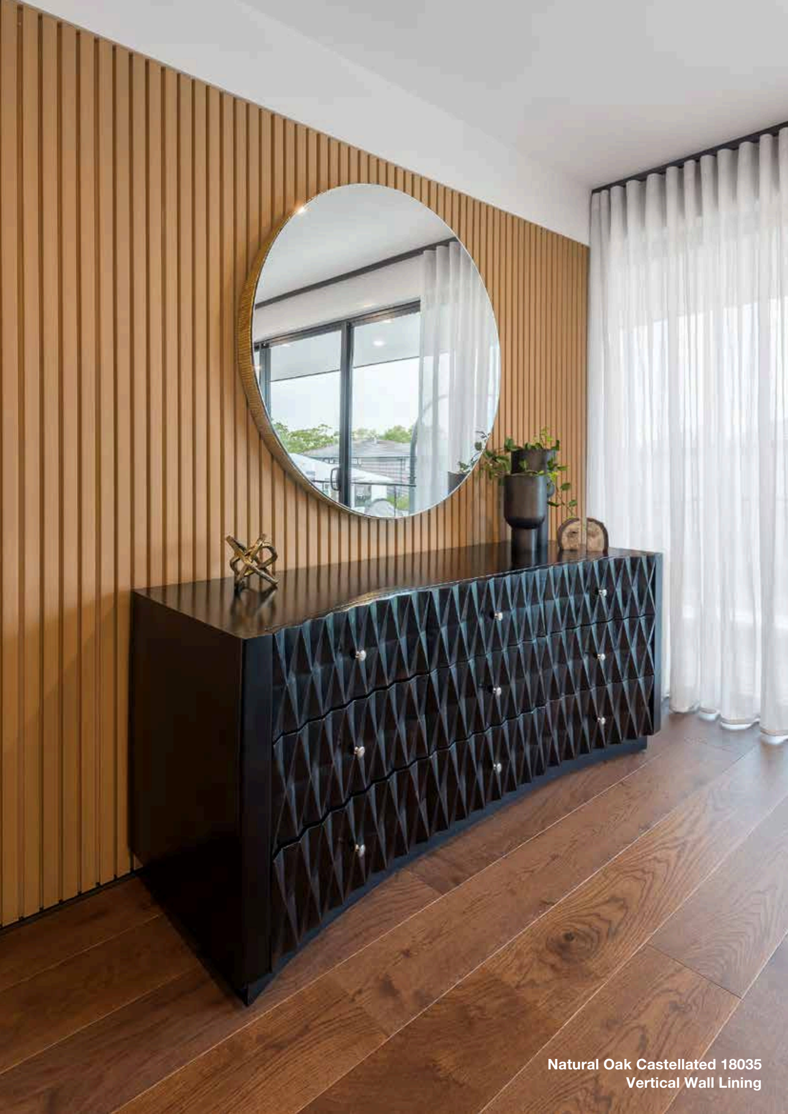
Natural Oak Castellated 18035 Vertical Wall Lining