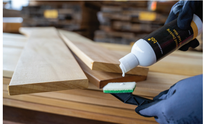
Above: bbi Hardwood Decking End Seal Wax being applied